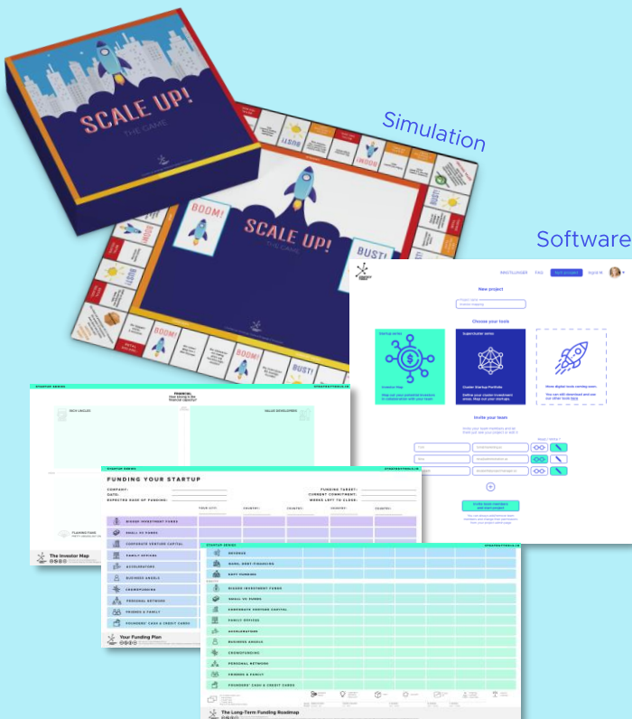
Strategy Tools Canvases