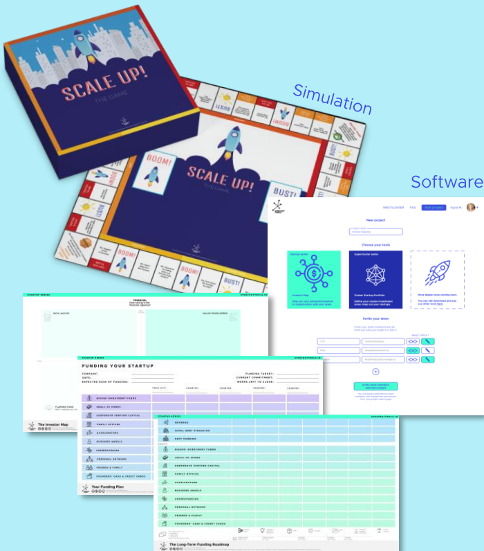
Strategy Tools Canvases

Simulation & software provide a blended solution